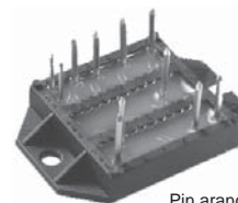
Pin arrangement see outlines